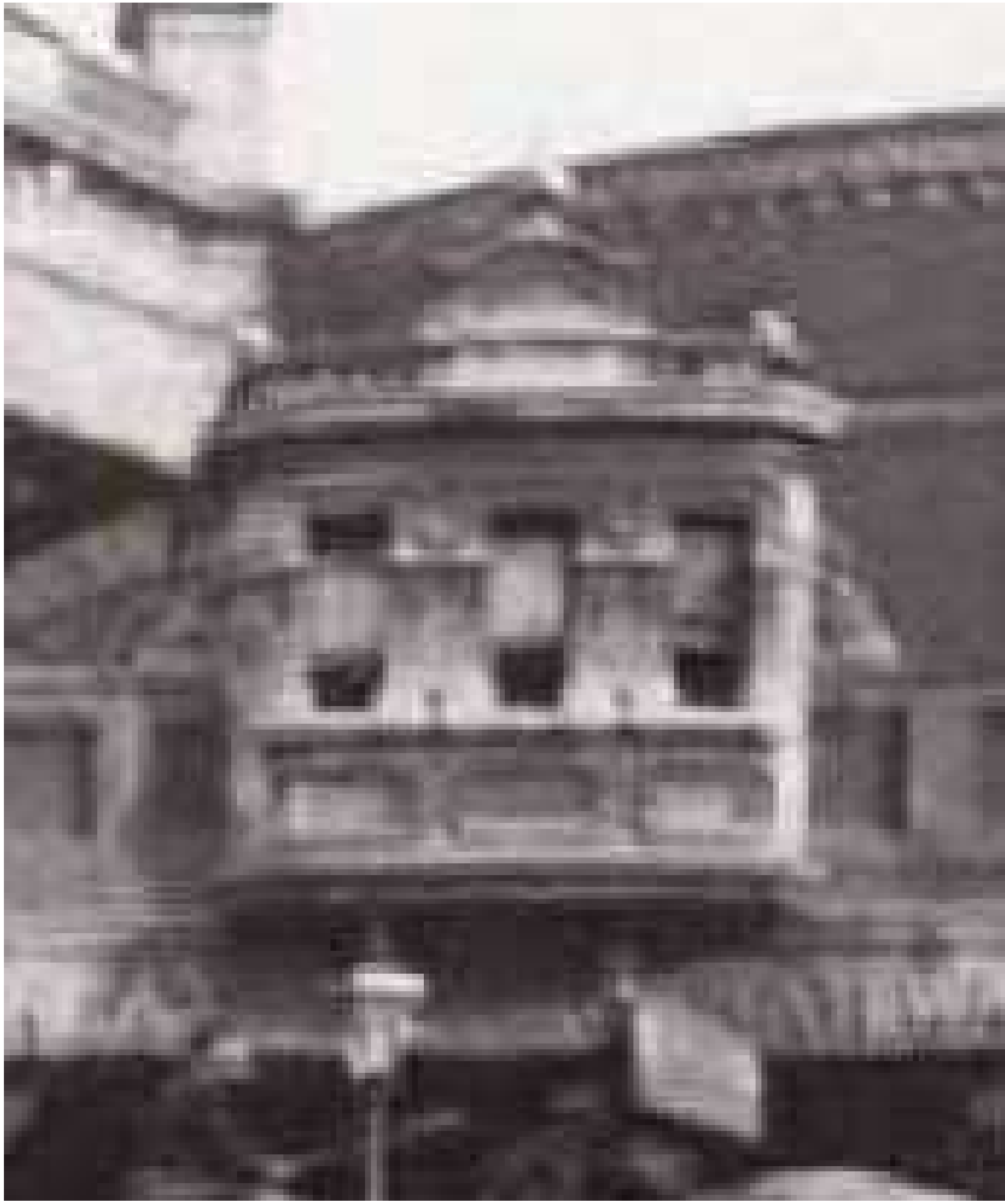
Archive Photo Oriel Structure view from Shoreditch Highstreet (circa 1924)

NOTE: REFER TO SPACE HUB DRAWINGS FOR SITE- WIDE LEVELS, PUBLIC REALM & LANDSCAPING REFER TO PLOWMAN CRAVEN SURVEY DRAWINGS: 15532-0108-04 (A) - Oriel Drawings FOR DETAIL OF LISTED STRUCTURES REFER TO: KMH HERITAGE STATEMENT & ALAN BAXTER CONDITION SURVEY